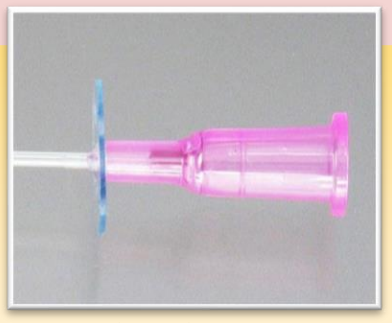
Soft and flat stabilizer

The soft stabilizer, the shaft side is flat and gently fits to the cat's body