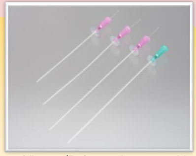
12typs of lineup (Refer to size composition)

In addition to the conventional 120 mm, the lineup of 80 mm and 100 mm